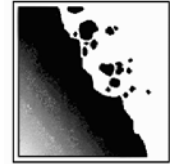
Figure 1. Plan view of area surrounding the insured's property, Harbor, Oregon. Map traced from Google Earth photograph (2005). See text for discussion.